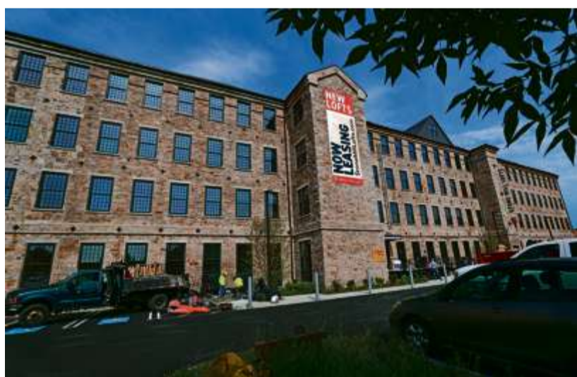
The Stone Mill Lofts building still maintains much of the site's historic charm, with a high tower looming over its granite structure.

Retrofitting buildings provides sustainability, much-needed homes, cities find