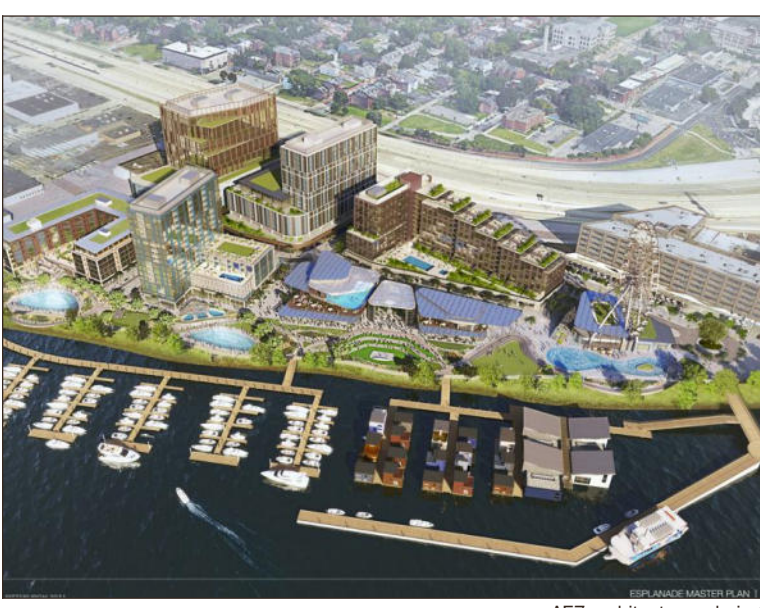
The first phase of developer Piatt Companies' $600 million Esplanade project on the North Side would include a giant Ferris wheel, a marina, a pavilion featuring a restaurant, a fresh food market and other amenities, and a 300-unit apartment building.