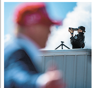
The former president distrusts what he calls the "deep state."