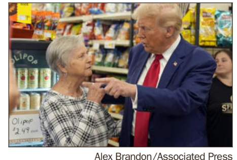
Republican presidential nominee and former President Donald Trump makes a point during a visit to Sprankle's Neighborhood Market in Kittanning on Sept. 23.