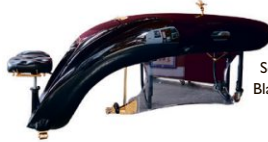
Schimell Pegasus Black Grand Piano.