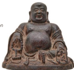
Chinese Figure of a Cast Iron Seated Buddha.

December 16th; 10 am December Gallery Auction December 13th; 10 am Preview: Sunday, December 8th; 10 am - 5 pm; Thursday, December 12th; 10 am - 5 pm; Friday, December 13th; 9 am - end of auction