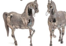
Pair of Indian Silver Caparisoned Horse Figures.