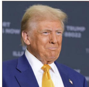
Republican presidential nominee and former President Donald Trump arrives to speak at a news conference Friday in Austin, Texas.