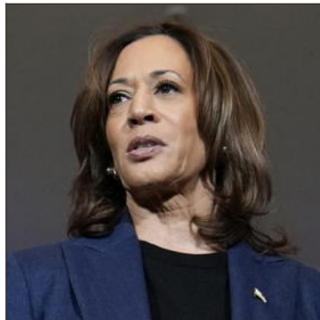
Democratic presidential nominee and Vice President Kamala Harris speaks to reporters in Houston on Friday.