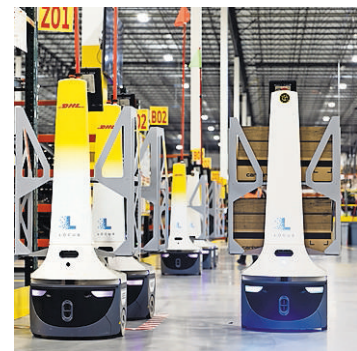
Robots at a DHL-run warehouse in Columbus, Ohio.

As robots become more capable, they are performing an increasing number of tasks in warehouses and delivery centers with varying degrees of aptitude and speed. Machines can load and unload trucks. They can place goods on pallets and take them off. Robots can shift items around in inventory, pick up packages and move goods on warehouse floors. And they can do all this without a