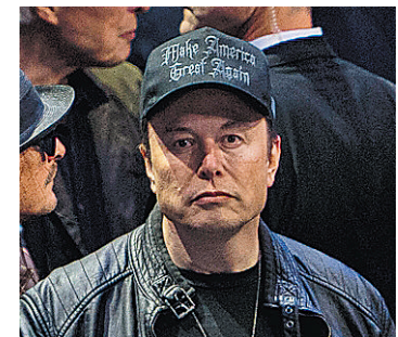
Elon Musk often prefers to cut too much rather than too little.