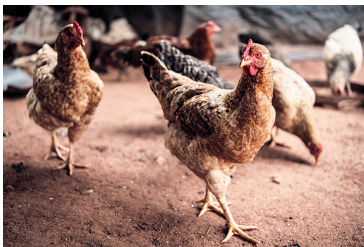
Village chickens in Petauke, Zambia. An initiative aims to replace them with the Zambro chicken, bred to be climate-resilient.