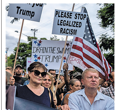
Rallying for President Trump in South Africa last month.

Under Phase One of the program, the United States has deployed multiple teams to convert commercial office space in Pretoria, the capital of South Africa, into ad hoc refugee centers, according to the documents. The teams are studying more than