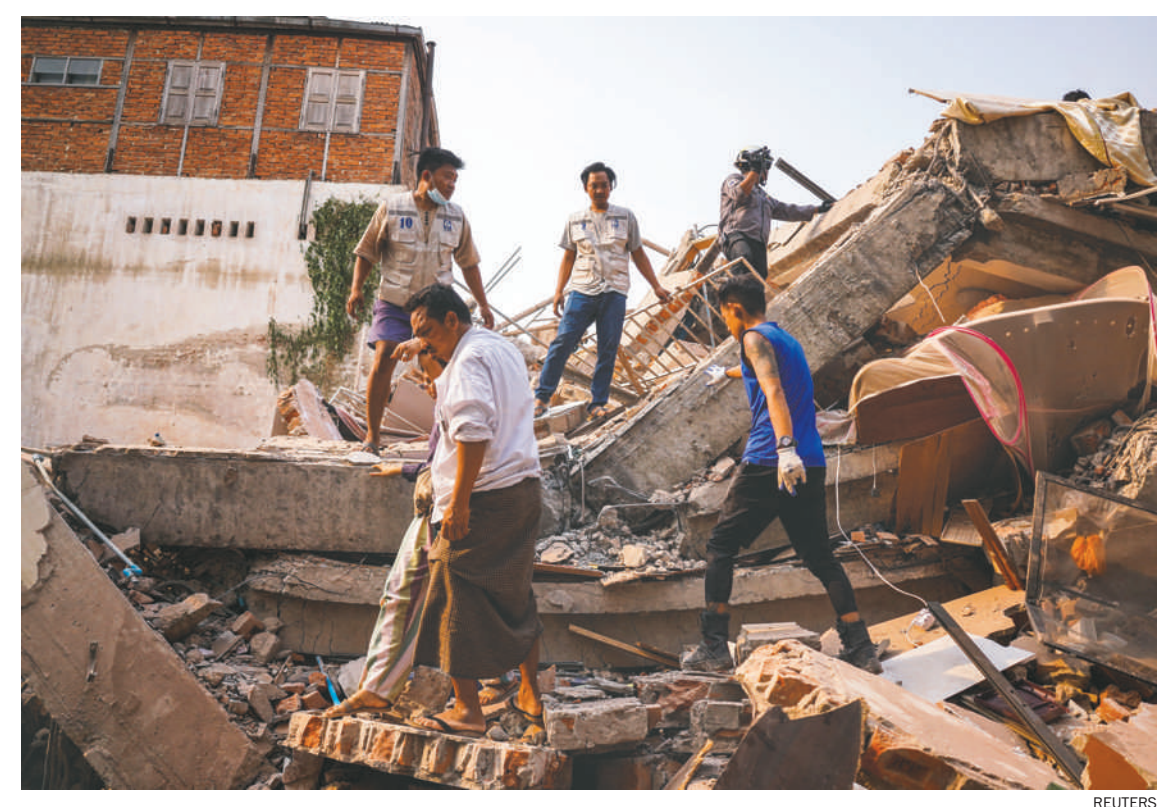
Rescuers work Sunday at the site of a building that collapsed in an earthquake in Mandalay, Myanmar.

The Trump administration has promised $2 million in aid, saying, "The United States stands with the people of Myanmar as they work to recover from the devastation." But distributing SEE MYANMAR ON A12