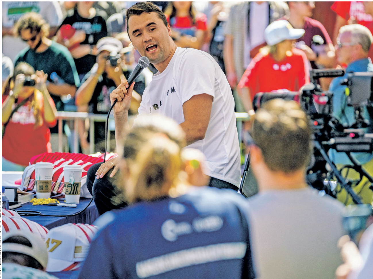
Charlie Kirk was speaking at an open-air event at Utah Valley University in Orem when he was shot on Wednesday.

Trump ally struck down at long range while giving a talk at Utah university