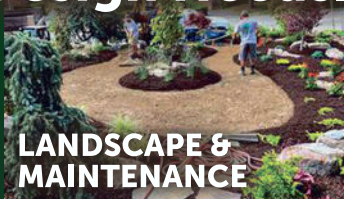
LANDSCAPE & MAINTENANCE