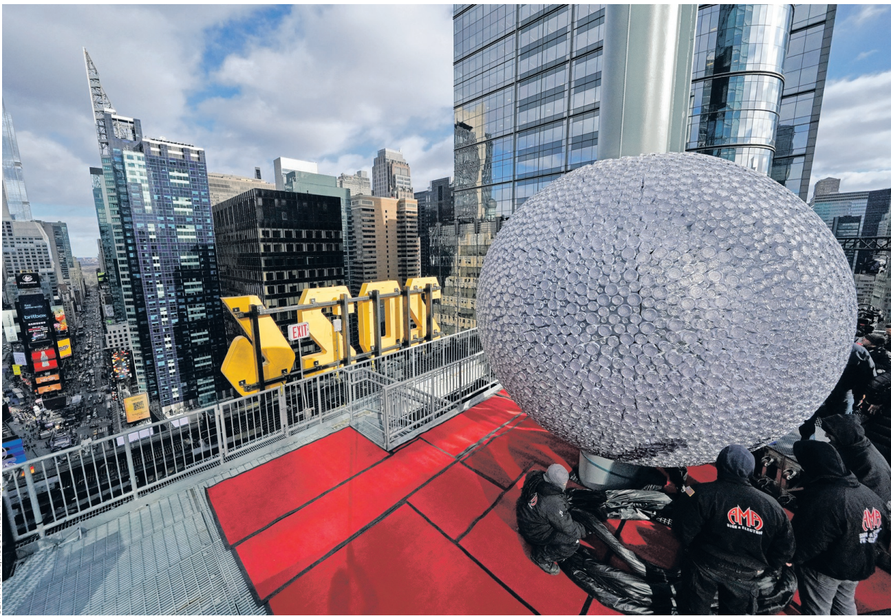
IN WITH THE NEW: The Constellation Ball, the ninth sphere in the history of the iconic New Year's Eve ball drop in New York City, measures 12.5 feet in diameter and weighs 12,350 pounds, with 5,280 Waterford Crystals in circular shapes and LED light pucks.