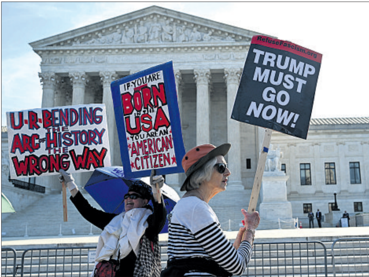
DEMONSTRATORS show their support for birthright citizenship outside the Supreme Court on Wednesday.