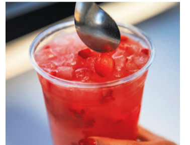
The Strawberry Breeze, on the menu at a Swig store in Utah.