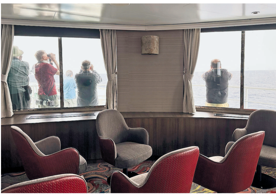
Passengers scanned the horizon during the Hondius's trip to the Canary Islands from Cape Verde.

Thousands of workers for the Long Island Rail Road walked off the job early Saturday morning, staging the first strike in more than 30 years for America's busiest passenger railway and grinding service to a halt. After three years of failed contract negotiations, two federal interventions and a volley of last-minute bargaining, unions representing about half of the work force decided to take to the picket line to protest what they called insufficient wage increases. Five unions representing more than 3,500 workers — including engineers, signalmen and machinists — called the strike after contract discussions with the Metropolitan Transportation Authority, the state agency that runs the railroad, fell apart. Kevin Sexton, a vice president of the Brotherhood of Locomotive Engineers and Trainmen, one of the unions, said the two sides could not agree on raises in 2026, or on issues like health care contributions. "We are truly sorry that we're in this situation," Mr. Sexton said at a midnight news conference outside of M.T.A. headquarters. "But this is why you have to take collective bargaining seriously." More than 270,000 daily riders rely on the service to travel between New York City and Long Island, a sprawl of suburbs and bedroom communities where many of the region's workers live. At the Kew Gardens-Union Turnpike subway station, a transfer point for passengers traveling from Long Island, there was no